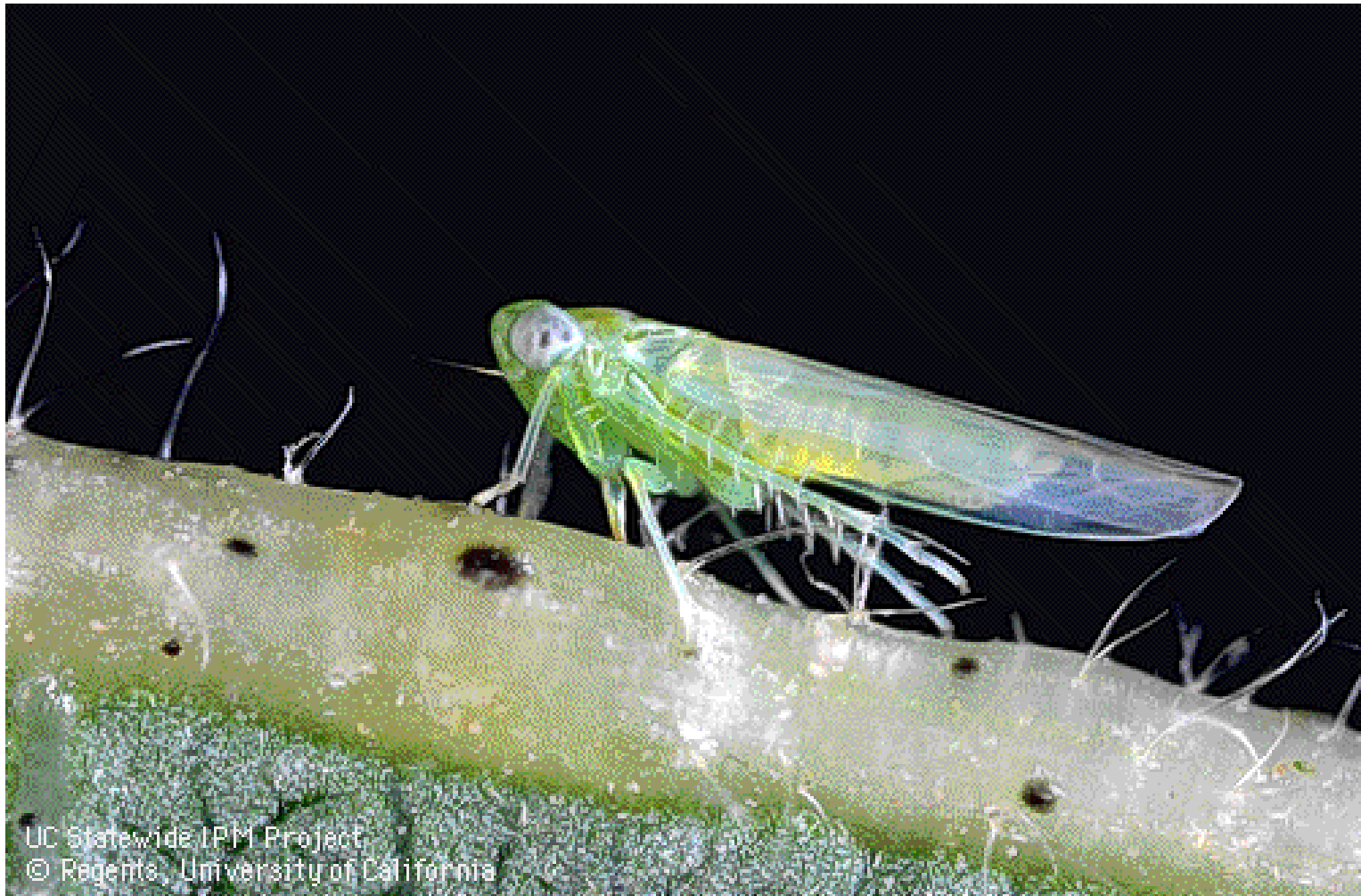
UC Statewide IPM Project